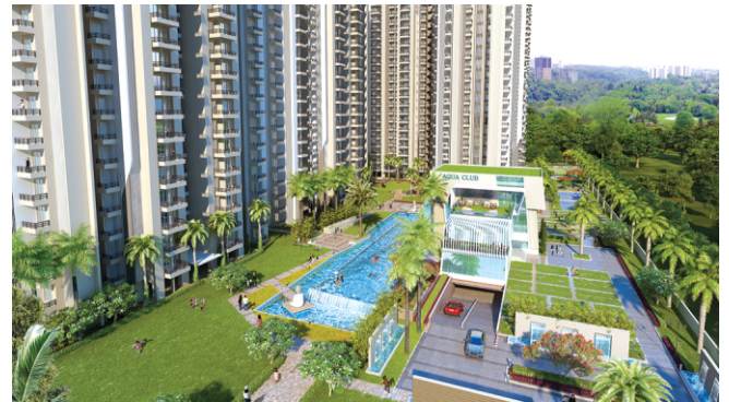
0% Vehicular movement at the ground level