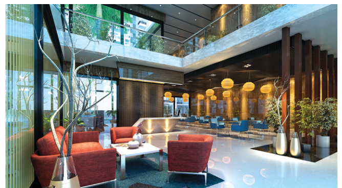
Entrance Lobby (Double Height)