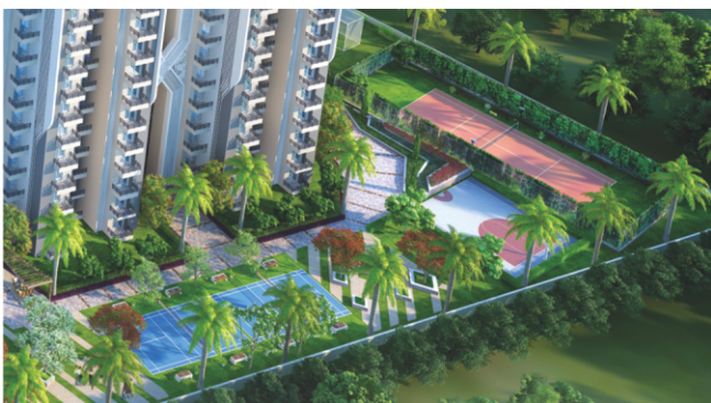
Play Area for Children