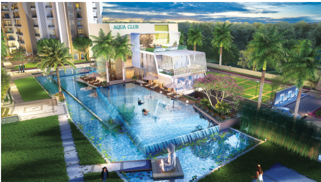
3-tier swimming pool and landscaping

HIGHLIGHTS: Spacious Entrance Lobbies at ground & basement level • Tower Drop-off at Basement Level • Adequate Parking facility for residential & Commercial • Commercial Plaza • Commercial in front and majorly on ground floor • Aqua Club and Pool • Multipurpose Lawn • 3 tier Security • Earthquake resistant structure • Exotic water features • Rain water harvesting • Sewage treatment plant • Provision of common toilet for support staff & visitors